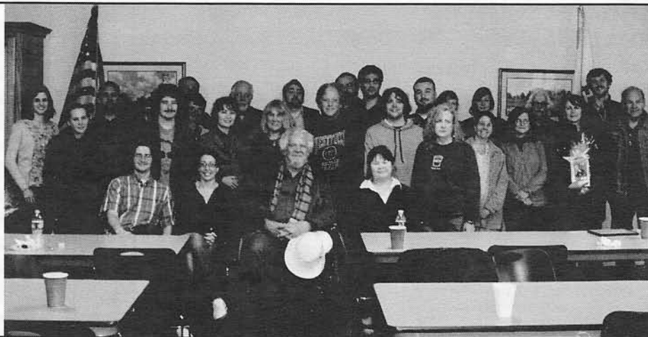
The 2009 Elizabeth Madox Roberts Society Conference attendees hosted by the Springfield Main Street/Renaissance