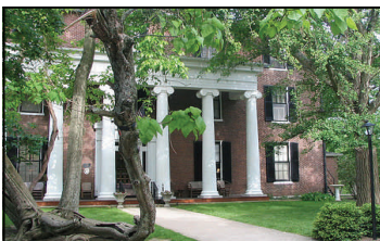
Beaumont Inn, Harrodsburg, KY